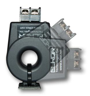
Universal mounting hardware for surface mounting