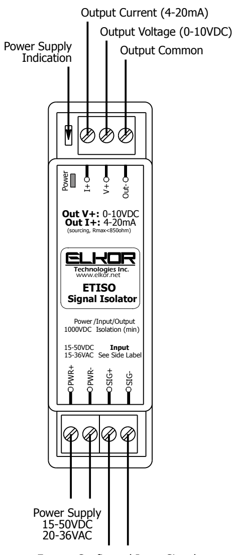
Factory Configured Input Signal: -V Model: 0-10VDC -A Model: 4-20mA (Custom inputs available)